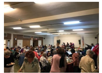
Hosting Grace Café for the community